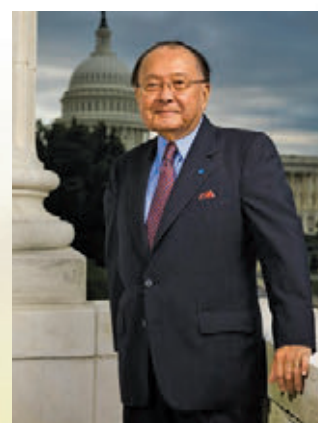
Senator Dan Inouye

As he would want it, HCF is continuously seeking to improve the impact of charitable giving in and for our community. Contact us to learn how you can get involved in creating a better Hawai'i for every one of us who lives here. Mahalo.